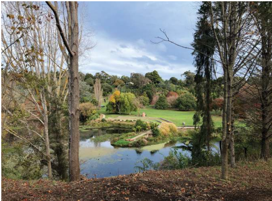
Over Lake from hill ...trees removed.

and shaping should be completed by the end of July (weather permitting) with final completion scheduled for mid September.