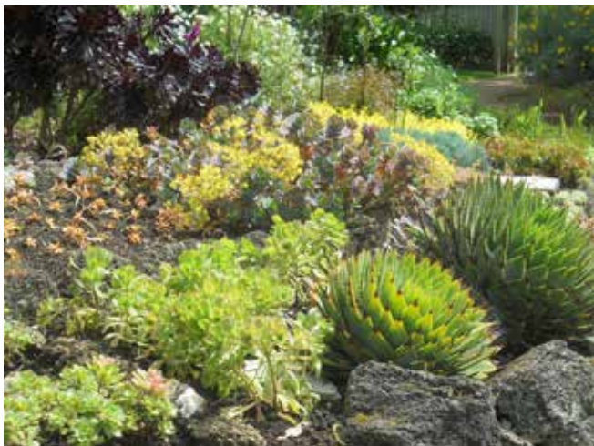
The succulent garden displaying plants suitable for full sun and poor soils.

in full sun and shallow soils, without blocking the view across the gardens.