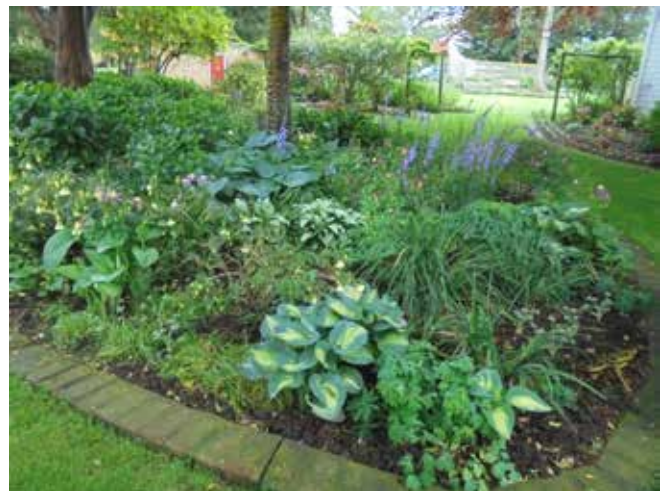
Well mulched bed illustrating plants that can cope with dry shade in the rear of the Homestead Garden.