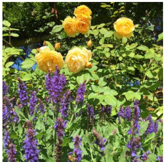
A lesson in complementary colour scheme in the Homestead Garden.

plannings around the steps, and an impressive collection of aloes and agaves on its zig zag lawn paths.