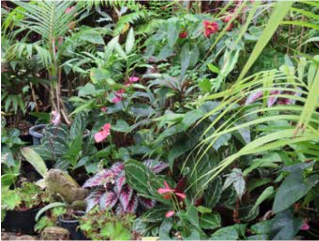
One of the changing displays of tender plants grown in the Conservatories.