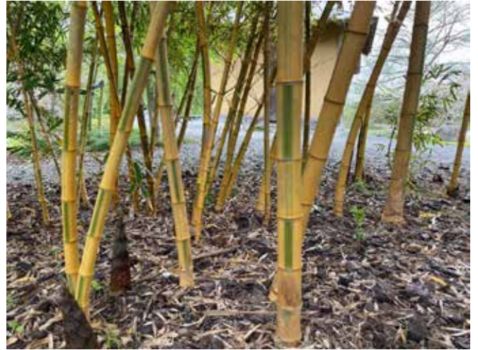
Phyllostachys aureosulcata 'Yellow Groove' in the Japanese Tea House Garden.